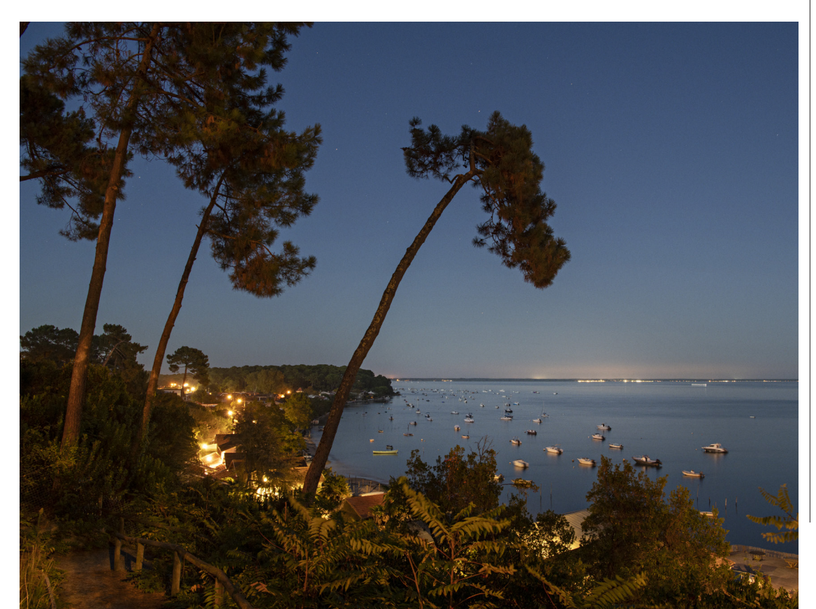
A view of the Arcachon Bay from Cap Ferret.

But neither is it like the tired old days, she added. "This side is smart. Pyla is very, very smart."