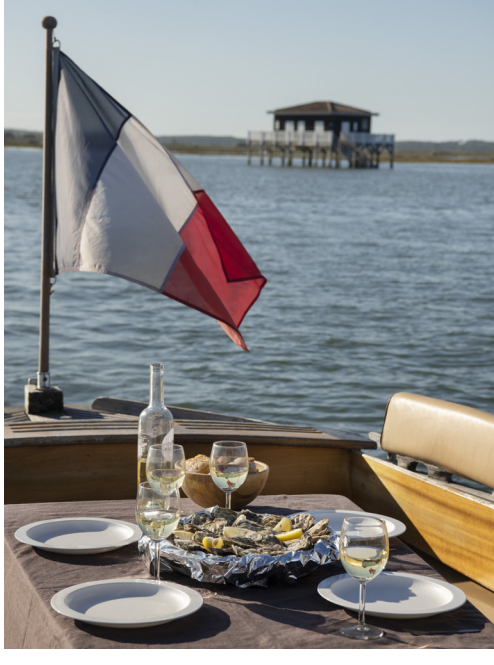
Above: An oyster degustation tour near L'Île aux Oiseaux. Left: La Co(o)rniche sits next to the Dune

Although he now owns homes around the world, Starck has lived near the Bassin d'Arcachon for 40 years. "It's one of the best places in the world," he said. The bassin, or lagoon, which partly empties with each low tide to mud flats studded with oyster-bed pickets and listing, beached boats, is anchored by the quaint