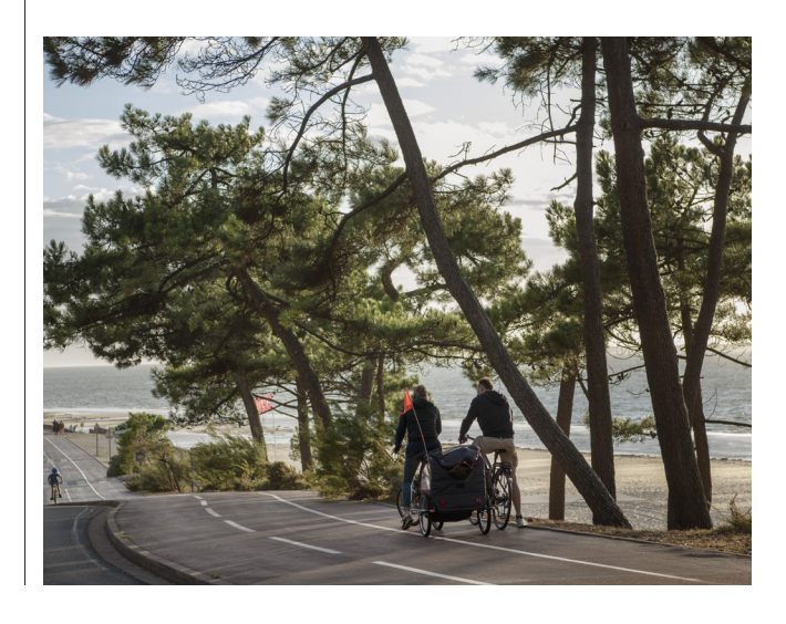
Left: Bicycle paths along Boulevard de la Mer in Arcachon. Above: The exterior of La Co(o)rniche.

Less accessible, Cap Ferret was a comparative late bloomer, initially attracting only fishermen and hunters, who built bare-bones cabins. In 1908, France auctioned off land at the peninsula's tip; called Les 44 Hectares, it's now some of the priciest real estate in France. The first Americans—soldiers—arrived in 1918, setting up a base on what's now called the Beach of the Americans. Development and tourism followed in the '60s, making Cap Ferret "very fashionable today with all these wealthy people," grumbled